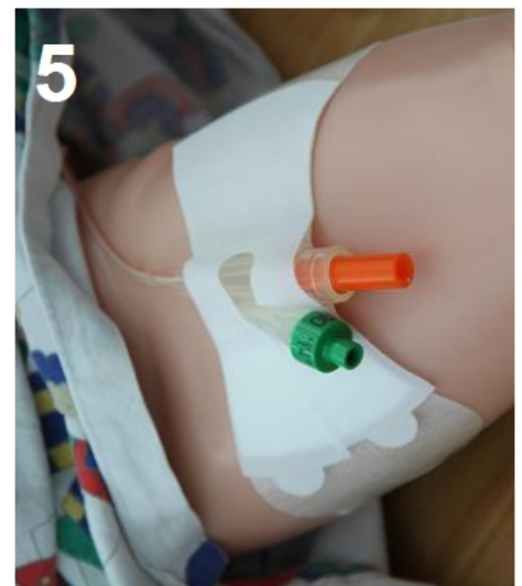
5 Pull the paper backing from one side of the Grip-Lok®. Then pull the paper backing from the other, to secure the Grip-Lok® in the desired position on the skin.