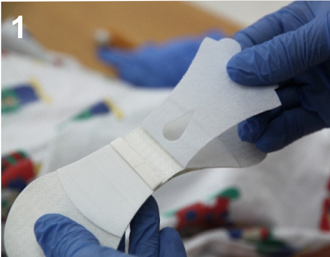
1 Open the Velcro® lid.

Prepare the skin according to the standard hospital protocol for dressing application. Skin prep or hair removal may be required on some patients for better adhesion.