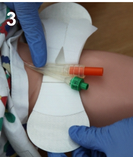
3 Place the bifurcation crotch centrally on the Grip-Lok®.